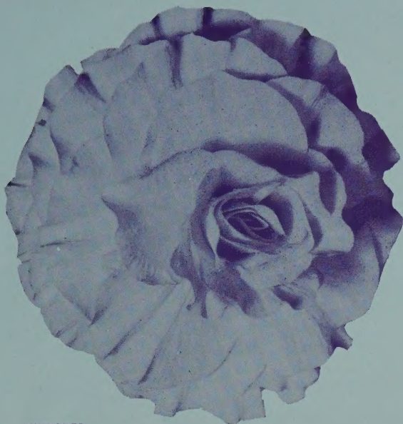
IMPROVED DOUBLE FLOWERING TYPES